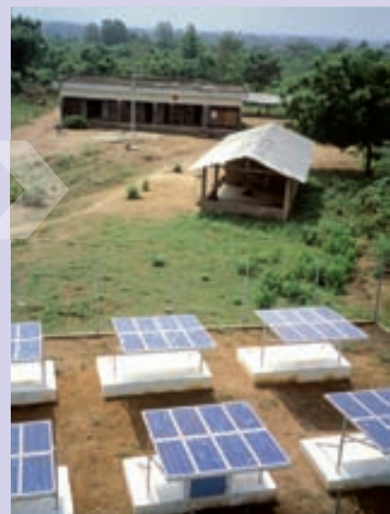
A rural solar installation powering a health centre and a school in Towé, Benin.

As a contribution to the mitigation of climate change, UNESCO, working with partners in UN-Energy, enhances the knowledge base for the rational use and application of renewable energy through institutional and human capacity building, sharing of scientific knowledge and best practices, and the promotion of national and regional renewable energy policies and management. Seminars on the proper management of solar photovoltaic (PV) systems are organized through the Global Renewable Energy Education and Training Programme, with special emphasis on Africa.