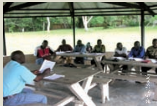
UNESCO-sponsored programme in the Réserve de Faune à Okapis, Democratic Republic of Congo, to teach ecology to park guards and students.