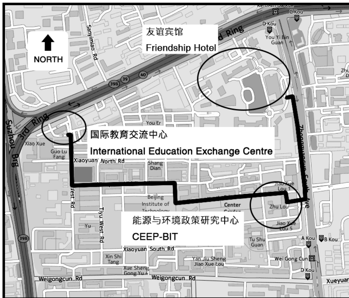
Map of Friendship Hotel, CEEP-BIT and International Exchange Center of BIT (Zhongguancun)