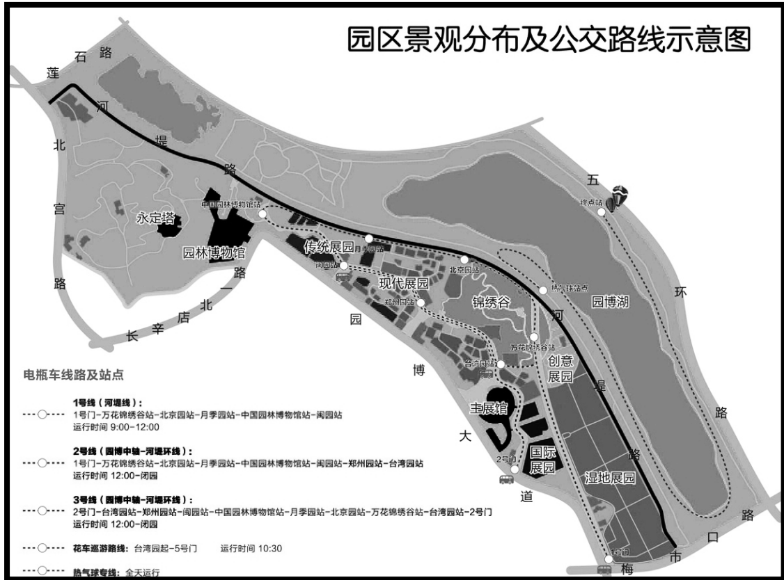
Map of The 9 th China (Beijing) International Garden Expo